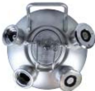
201-420 can top view